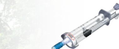
Graftys® QUICKSET Double-compartment Syringe with a Cannula

Compressive strength: Within the range of cancellous bone compressive strength (24MPa after 24 hours)