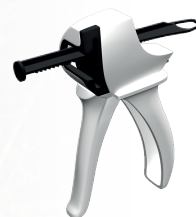
Graftys® QUICKSET Delivery Gun (Optional)